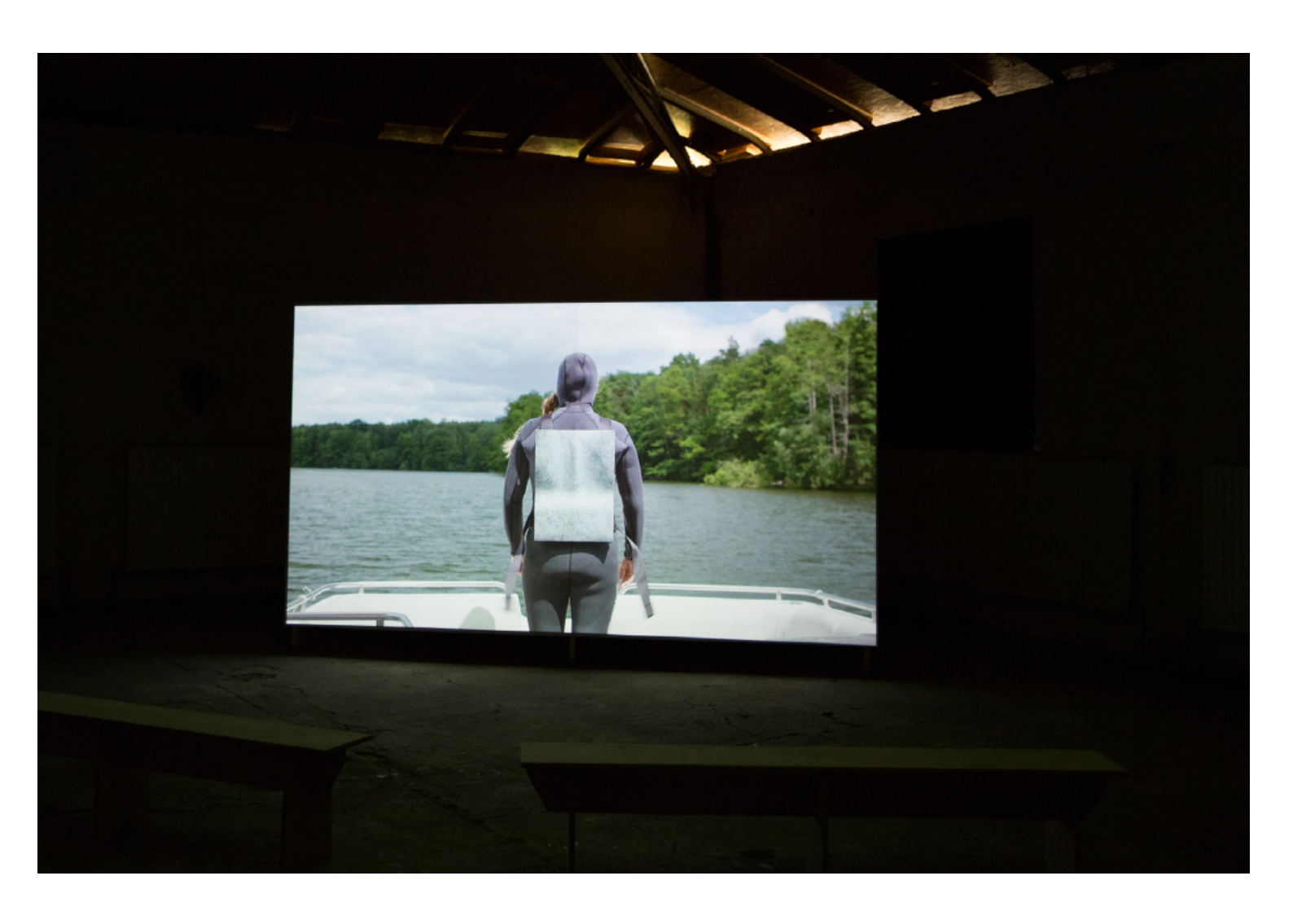
Sabrina Brückner San Francisco Verde 2018 video installation, sound 10:56 min (still)