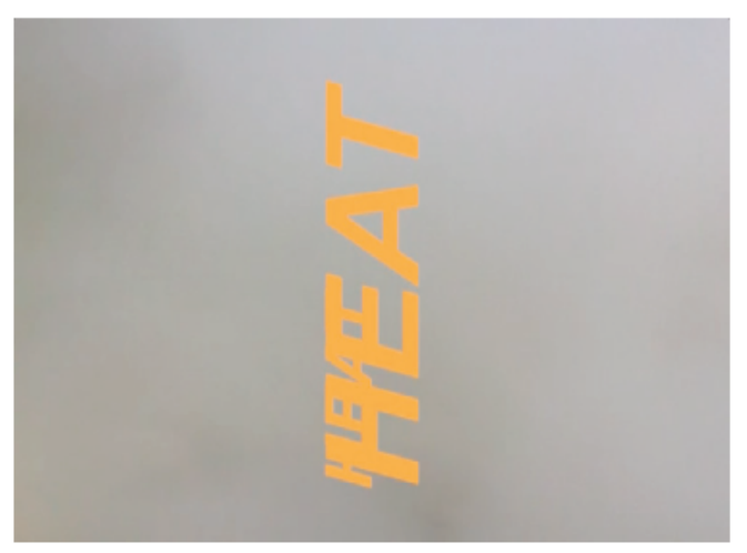
Kim Bode Heat 2017 multi channel video 4:20 min (stills)