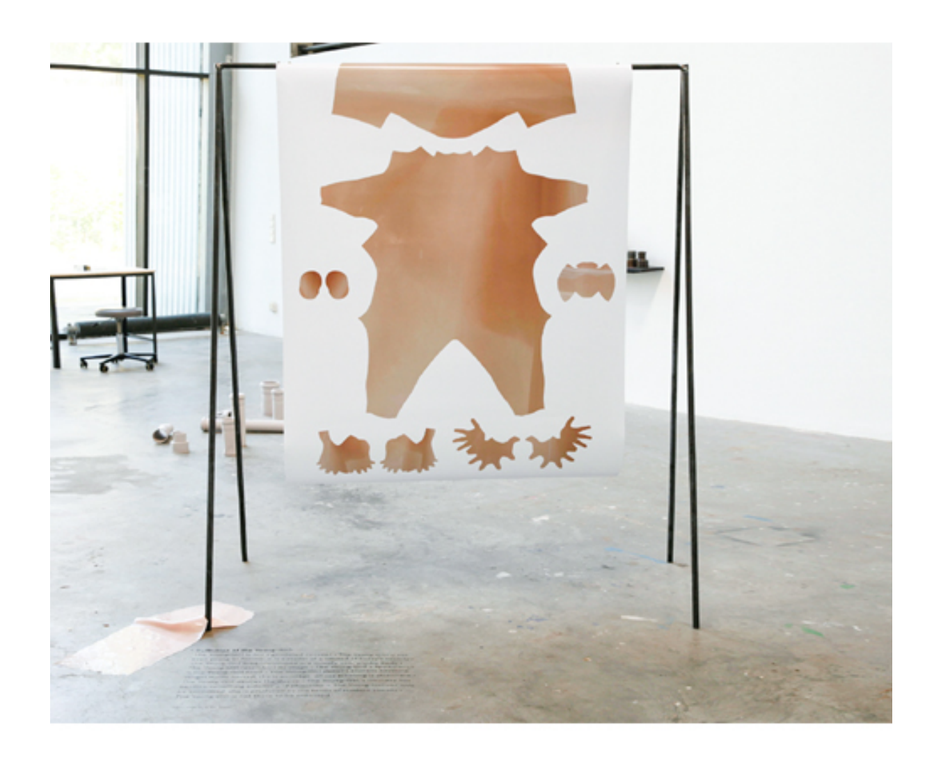
Tabea Marschall The Recreation of the Young Girl 2016 mixed media 150 x 180 cm installation